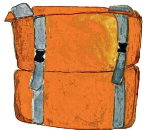
Baby Alpacas, Bottle, Blankets for the twins, Saddle, and Pack for the Llama