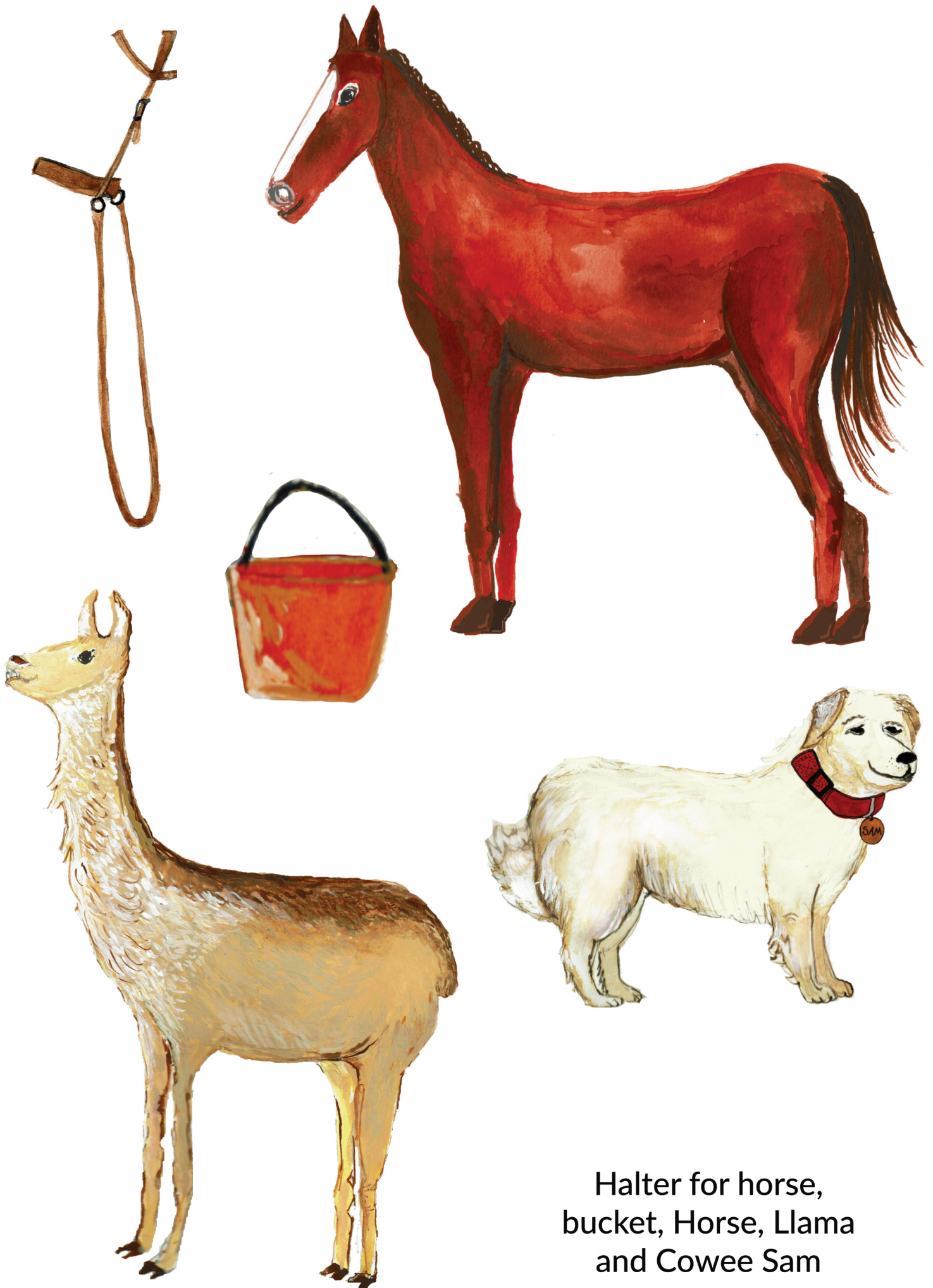
Halter for horse, bucket, Horse, Llama and Cowee Sam